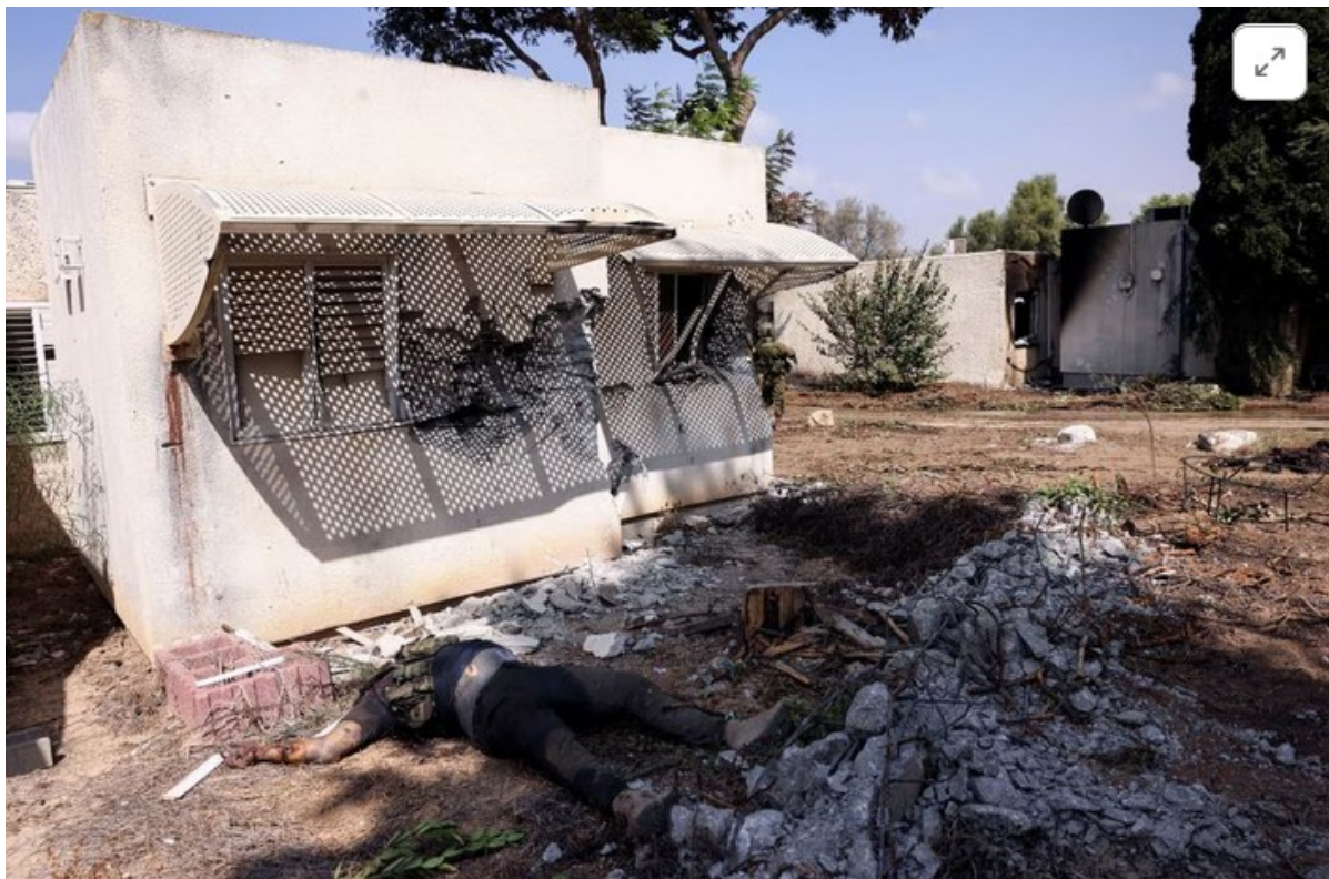
"The body of a man lies amongst rubble on Kibbutz Kfar Aza, in southern Israel, October 10."

I don't see why someone would be dressed like they were ready for a night out (i.e. shiny leather leggings and leather biker jacket) at 6 or 7 in the morning. Are we looking at a bike/car accident victim reallocated from a morgue, perhaps?