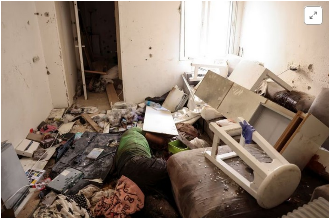
"The body of a man lies amongst rubble on Kibbutz Kfar Aza, in southern Israel, October 10."

So now I'm thinking these are abandoned buildings. This isn't a normal apartment with a corpse, that's an abandoned building with a bloke lying on the ground pretending to be dead. No visible wounds or blood.