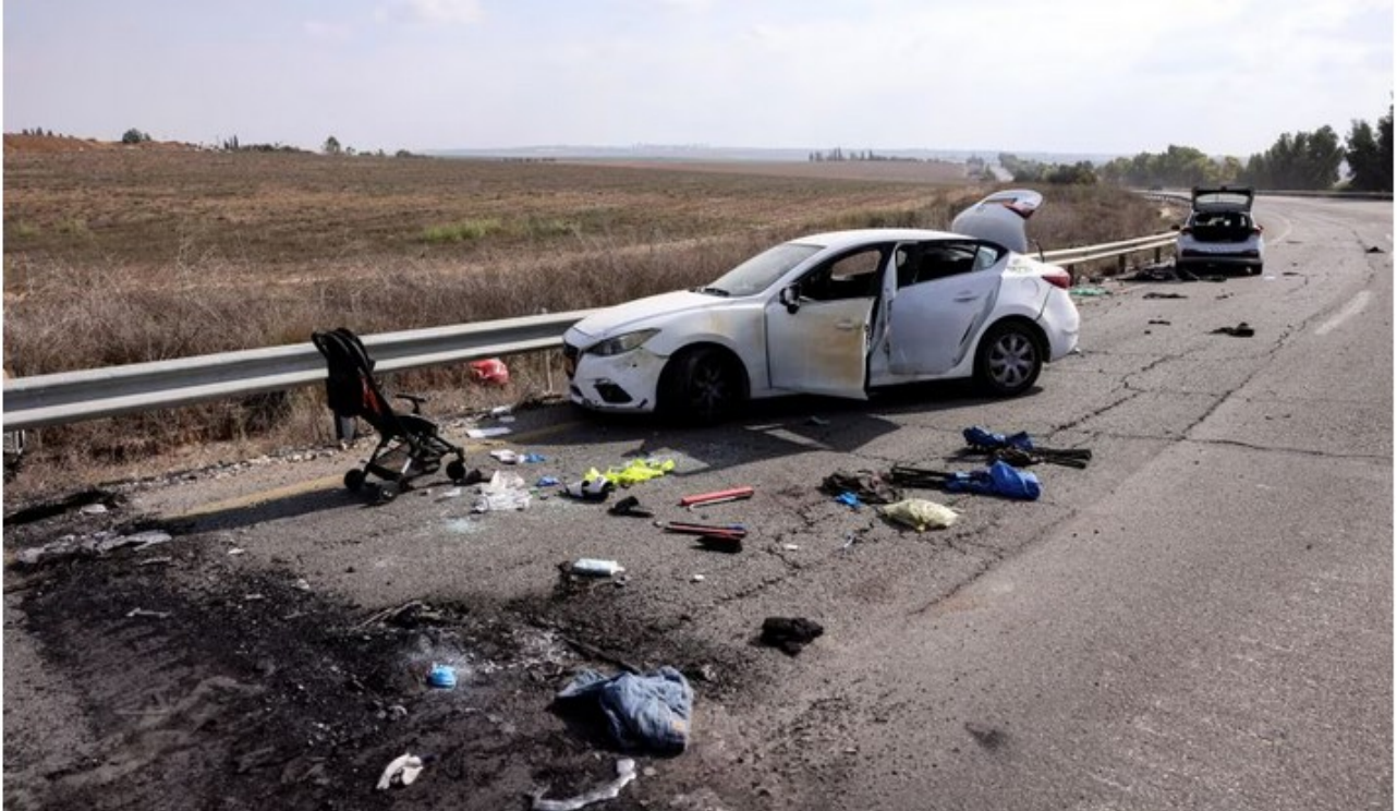
"Personal belongings including a child's stroller are seen on the road next to a car near Kibbutz Kfar Aza, in southern Israel October 10"

Oh wow, so Hamas shot the car and its occupants.