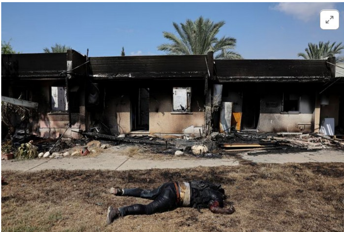
"The body of a man lies next to destroyed buildings on Kibbutz Kfar Aza, in southern Israel, October 10."

So now I'm thinking these are abandoned buildings. This isn't a normal apartment with a corpse, that's an abandoned building with a bloke lying on the ground pretending to be dead. No visible wounds or blood.