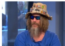
5-Time Lotto Winner Hated By Lottery Officials (See His System for Winning)