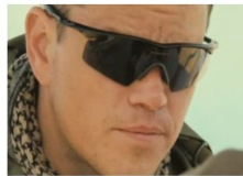
Should These Sunglasses Be Legal?