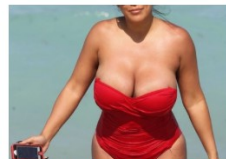
12 Totally Awkward Vacation Pics