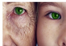
Mom Shocks Doctors: Forget