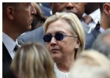
Hillary's Ex-Secret Service Agent: "There is Something Seriously Wrong With