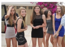
45 Epic Photos That Um, - Just