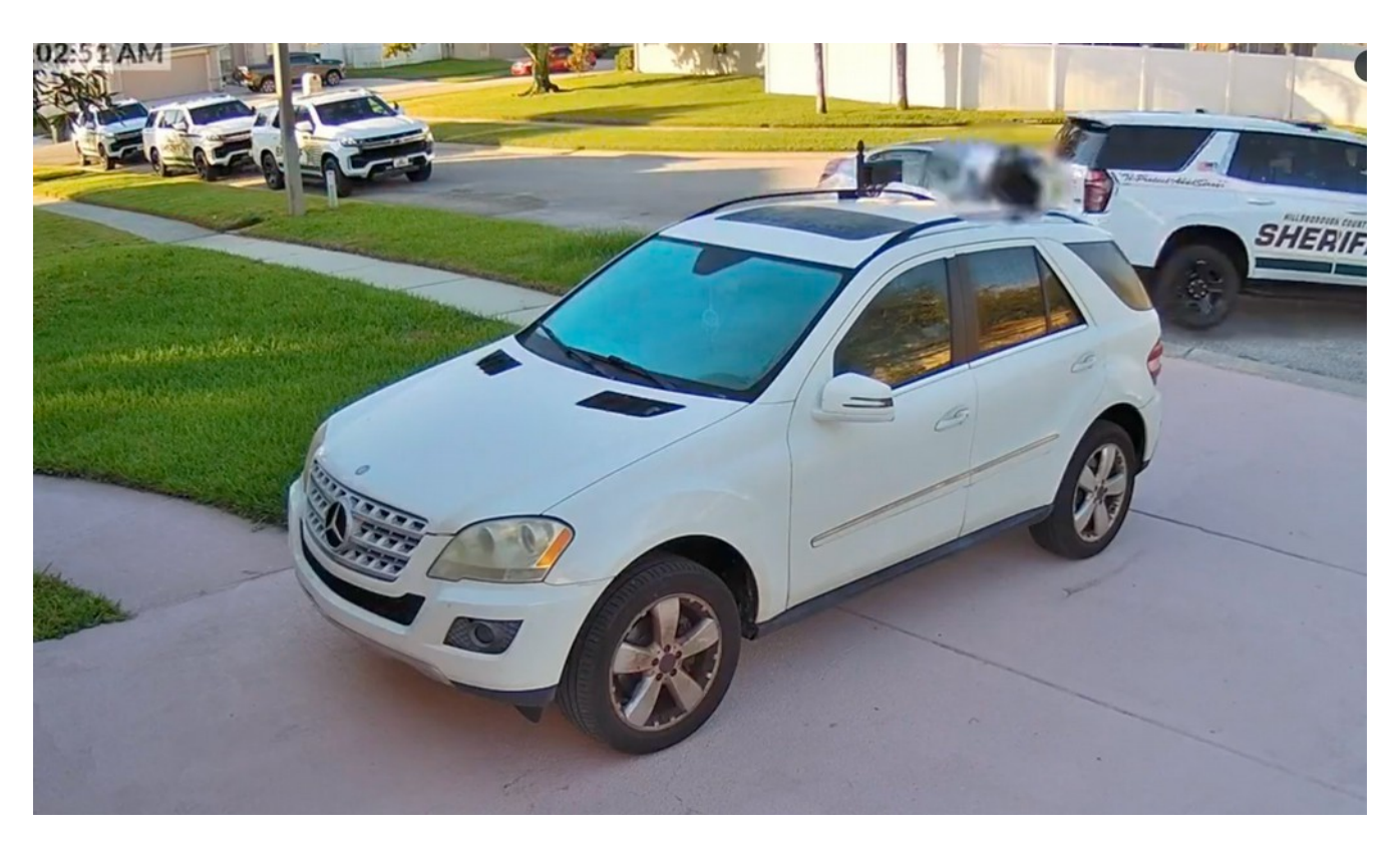
I took that right from the video they have posted. Notice anything strange? What about the fuzzy circle where the flying cop is supposed to be? Here's a second frame: