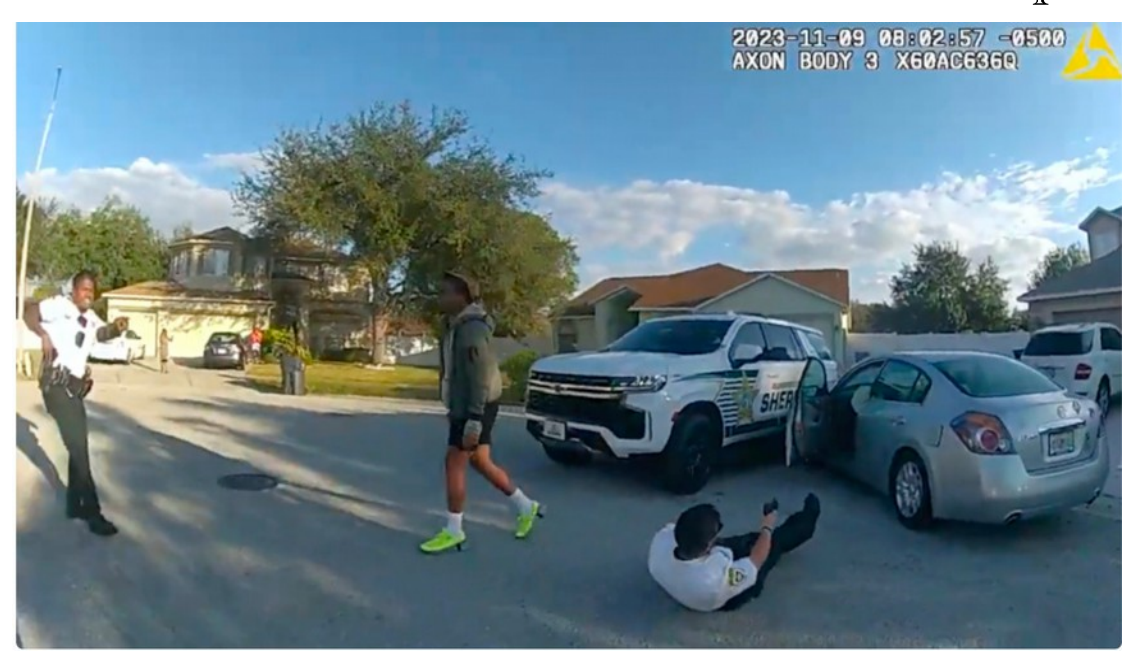
Just another CGI fake