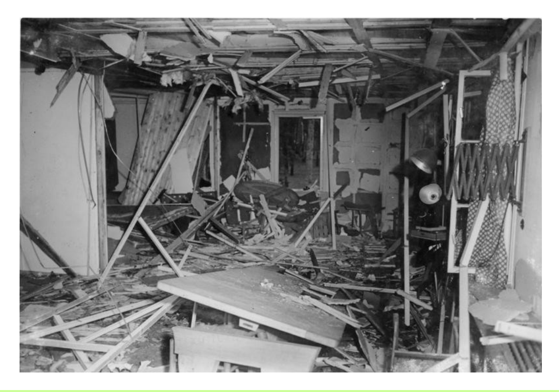
Plus, that room looks nothing like a meeting room at Wolf's Lair, which was of course extremely posh. It looks like a poor Gentile's basement in Hamburg. Do you really

Besides, do you see any doors or windows in this room? No? Huh.