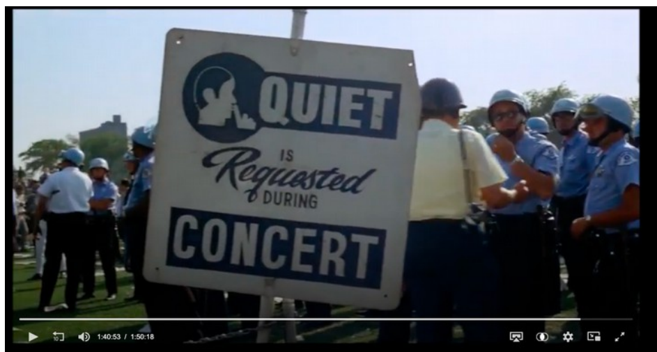
Medium Cool (1969) by derganzblonde

At minute 1:38:00 the military arrives with its armored cars. Of course it does, since it has to protect its actors from anything real breaking out. At minute 1:39:00, they break out the teargas, and a reporter says, "Lookout, it's real!" Except that it isn't, since the same reporter just stands there without a gas mask on. Then we move forward a few minutes, to many people injured. Except that Happy Days are Here Again is playing as the soundtrack and if you pay attention, you can see the injuries are all fake. At minute 1:40:53, we see this sign near the police: