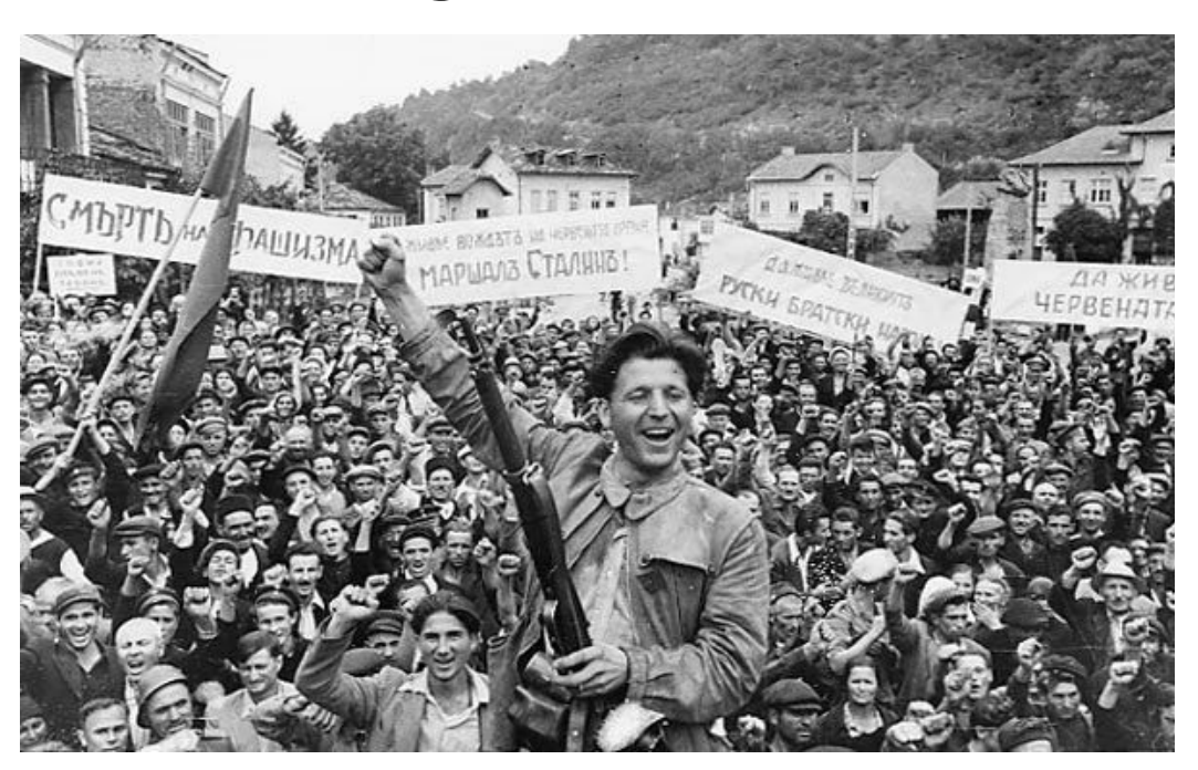
by River Bottom