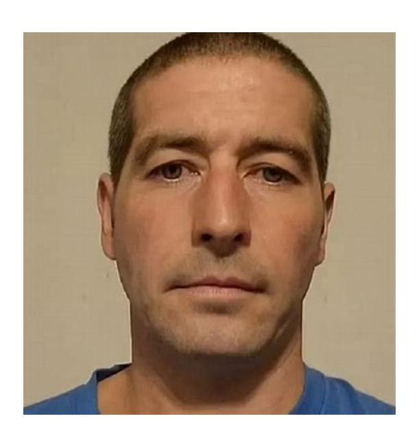
of course they all are