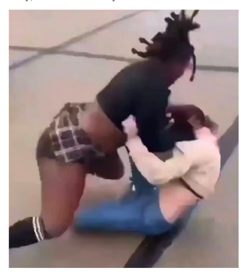
[Added March 24: Actually, I think that is exactly what it was:

I went back for a second look, and noticed how strange the flooring looks there. It looks like a bunch of gymnastics mats taped together, doesn't it?]