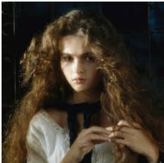
the Helena Bonham Carter I prefer to remember