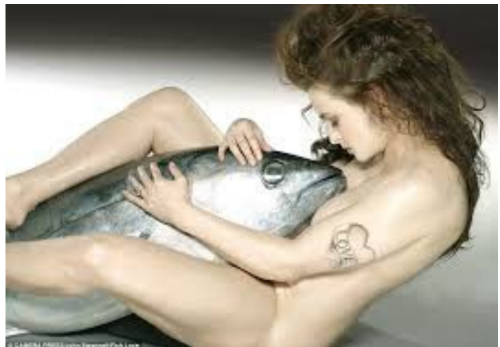
the real Helena, apparently

I guess Daisy Ridley will also be coupling with tunafish in a few years. Daisy is also related to Alexander Konstantinowitsch Graf von Benckendorff, the Russian ambassador to England under Nicholas II. His father and uncle were generals in the Russian army.