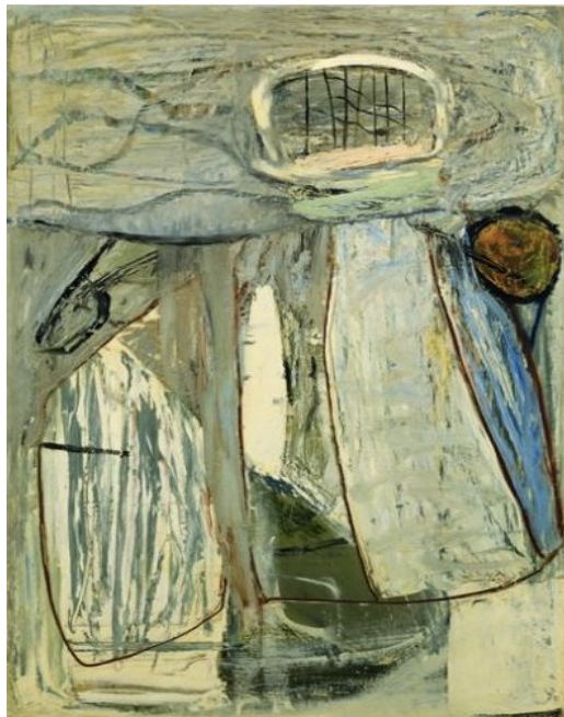
That's from Bowie's collection. Is it upside down? Turn it over: it looks a lot like the Flintstones' living room.

Before we continue, I want to pause to remind you that Bowie was a big promoter of Modern “art”. Not only did he have a large collection of expensive nullities, he was constantly promoting Modernism as something worth talking about—which of course it isn't. This is just another indication of who he was and who he was being paid by. So his show should have been at the Tate Modern, if anywhere. Why was it at the Victoria and Albert? Same reason the Turner Prize shows are at the Tate Britain instead of the Tate Modern: they want to take over all the old museums, slowly turning them into circuses. Eventually they can store or sell all the real art and use the floor space for jello pits.