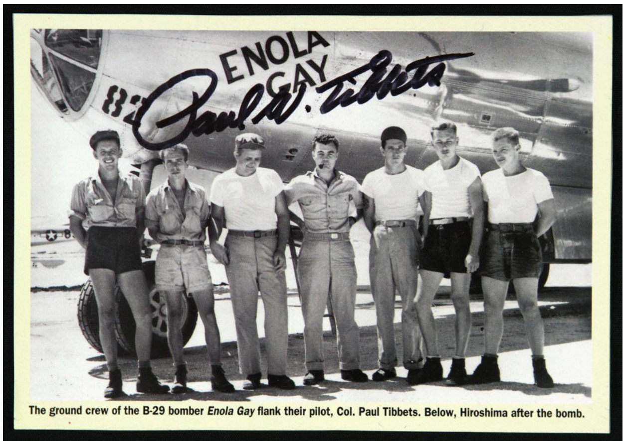
The ground crew of the B-29 bomber Enola Gay flank their pilot, Col. Paul Tibbets. Below, Hiroshima after the bomb.

Do I have to explain this to you? It's the usual transparent gay lingo, inserted by some truly sick bastards into this fake history to further discombobulate and confuse their audience. “Do not see what is right in front of you!” Look away. It can't be what it seems to be, so we will pretend it is meaningless.