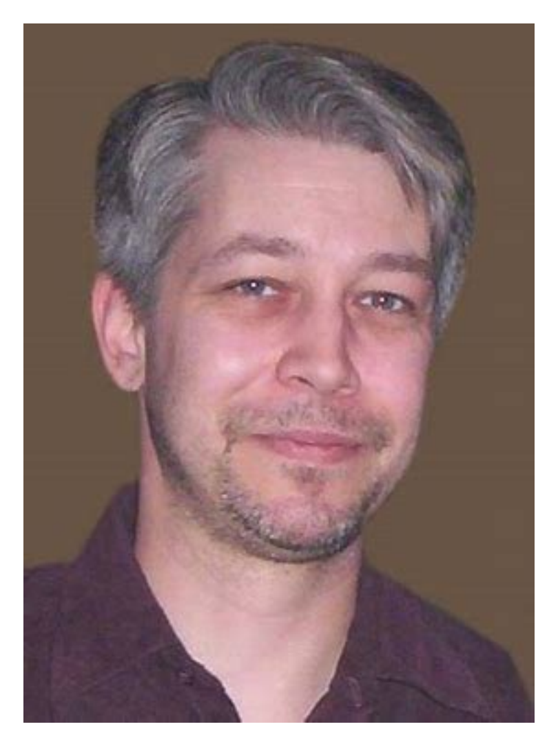
That's him. You might be thinking he looks about right for 49. Well that picture is from 20 years ago! Here is a more recent picture of him.