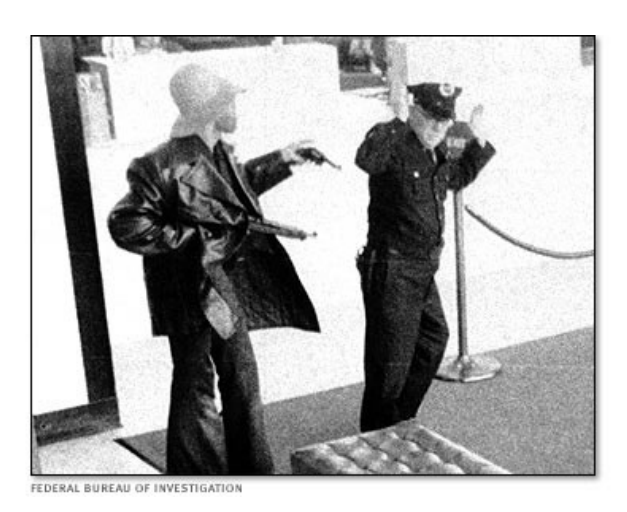
Study that, and get back to me.

If that doesn't convince you, here's another one: