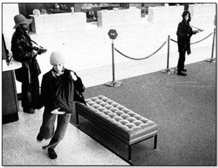
FEDERAL BUREAU OF INVESTIGATION

Look at DeFreeze there, and compare it to the previous one. Some will tell me my analysis of the previous one didn't work because the light is so bright. They will tell me the bright light washed out his features and blew his nose right off. But the light is just as bright here, and yet his face and hat are ten shades darker. Also notice the gun. He isn't holding it through the coat, is he? No, we can see his forward arm and hand. And notice the strap! The strap attaches to the end of the gun, doesn't it? But in the previous picture they forgot to draw it in.