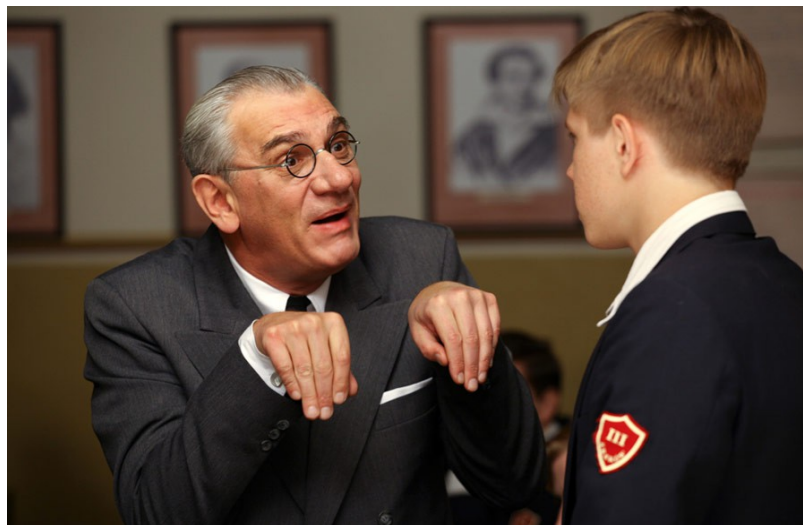
Wiktor Zborowski showing a young golfer the gopher pose from Caddy Shack