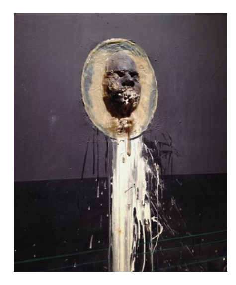
Keep in mind this guy was accepted into many fine arts schools. The Pennsylvania Academy was a realist school (non-Modern) back then, so he must have got in on a bye.