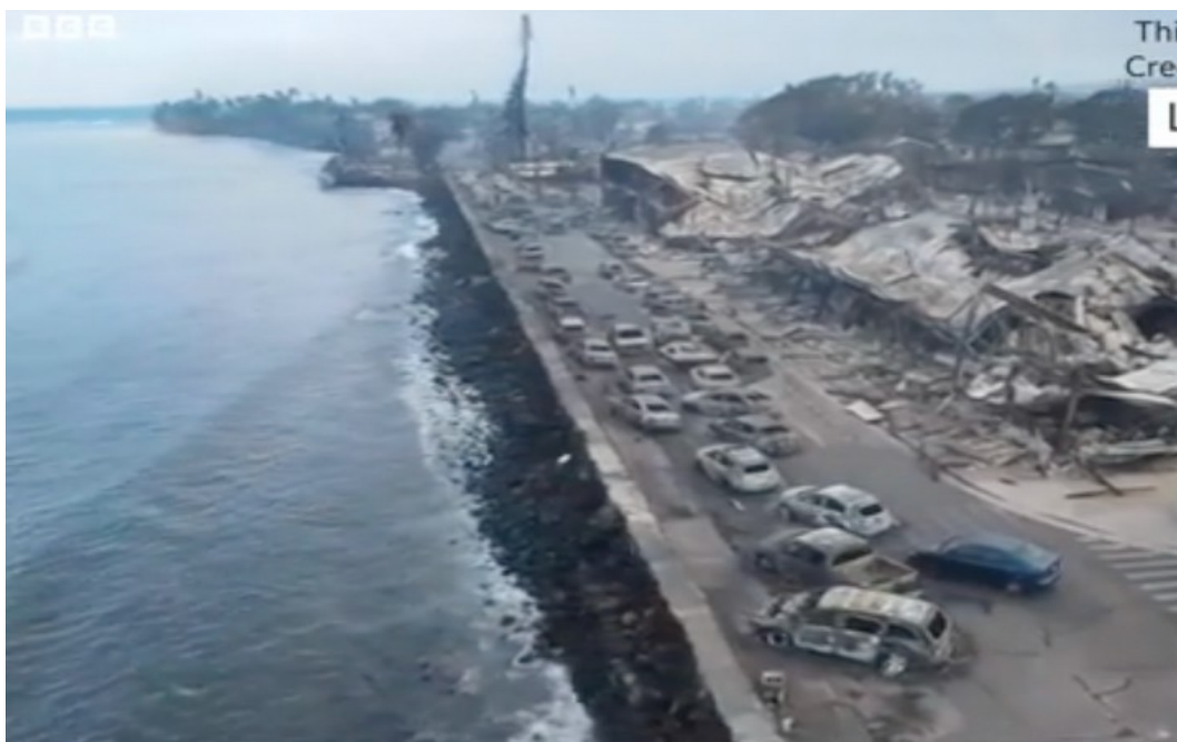
Watch: Extensive devastation left by Maui wildfires

We are told up to a thousand people are unaccounted for. Really? Tourists, maybe? Did they check on the mainland? It looks like they are going to ramp the death toll way up, to make this look real and create more fear, but that will just make the event even stupider. For I repeat what I said above: these people were just a block or two from the ocean. Why would they sit in their cars and watch the flames engulf them? How about get out of the stinking car and run down to the ocean? Oh yeah, they are telling us the ocean was on fire. Metal boats sitting in the water were burning, as so often happens. SO THERE WAS NO ESCAPE!