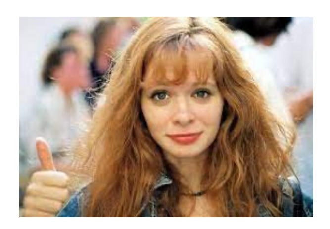
by Miles Mathis

First published September 1, 2022 As usual, this is just my opinion, arrived at by the easy online research I give you below