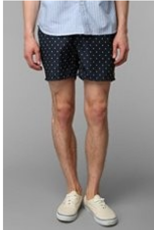
$68 OBEY swim trunks

with tight shirts that made them look even weaker and more emasculated. Their pants and jackets all fit poorly and were cut in all the wrong places. They looked sort of like Dr. Seuss characters, without the charm.