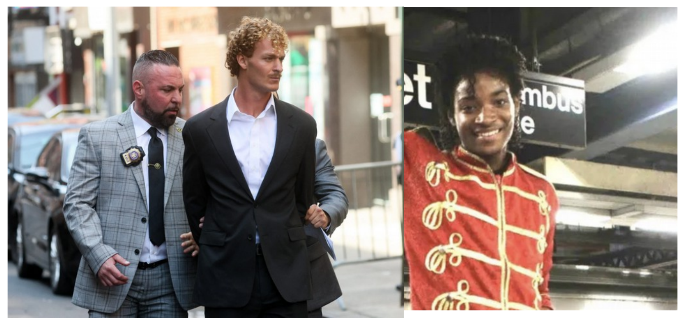
Yeah, it's Fake