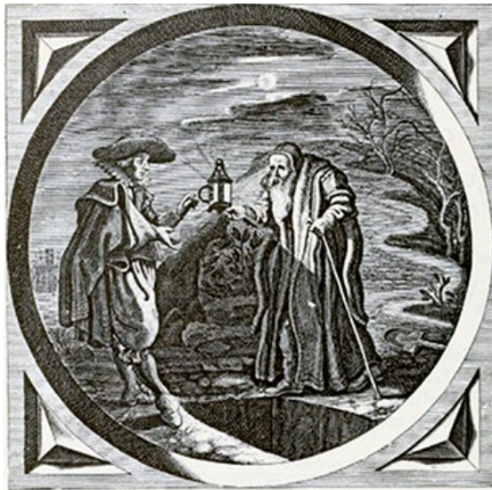
Jacob Cats, Lampado Trado , Dee passing the lamp to Bacon

Bacon also had ties to Germany. All the royals and elites of England had ties to Germany, most of them blood ties—especially to the north/central parts of Germany like Hanover. They still do, since of course the Windsors are actually Saxe-Coburg-Gothas from this same region (Bavaria/Thuringia, just south of Hanover and east of Kassel). The Rosicrucian texts were published in Kassel, which is near the southern borders of the old Hanoverian region in Germany. In fact, there exists a lot of evidence