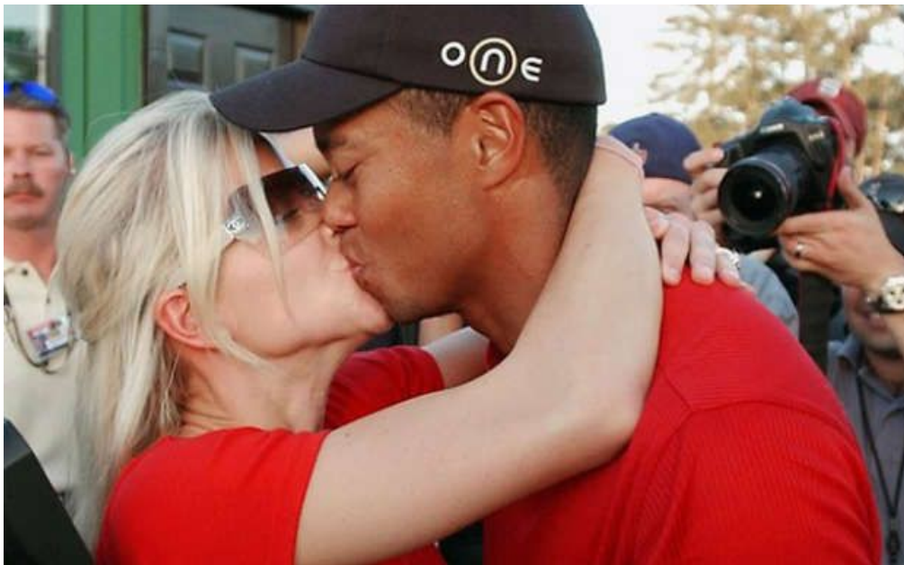
A Hollywood kiss