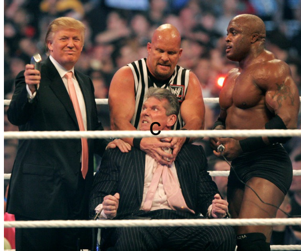
That is a real photo. Not doctored.

buy a Big Gulp, a box of Twinkies, and go to a WWF wrestling match.