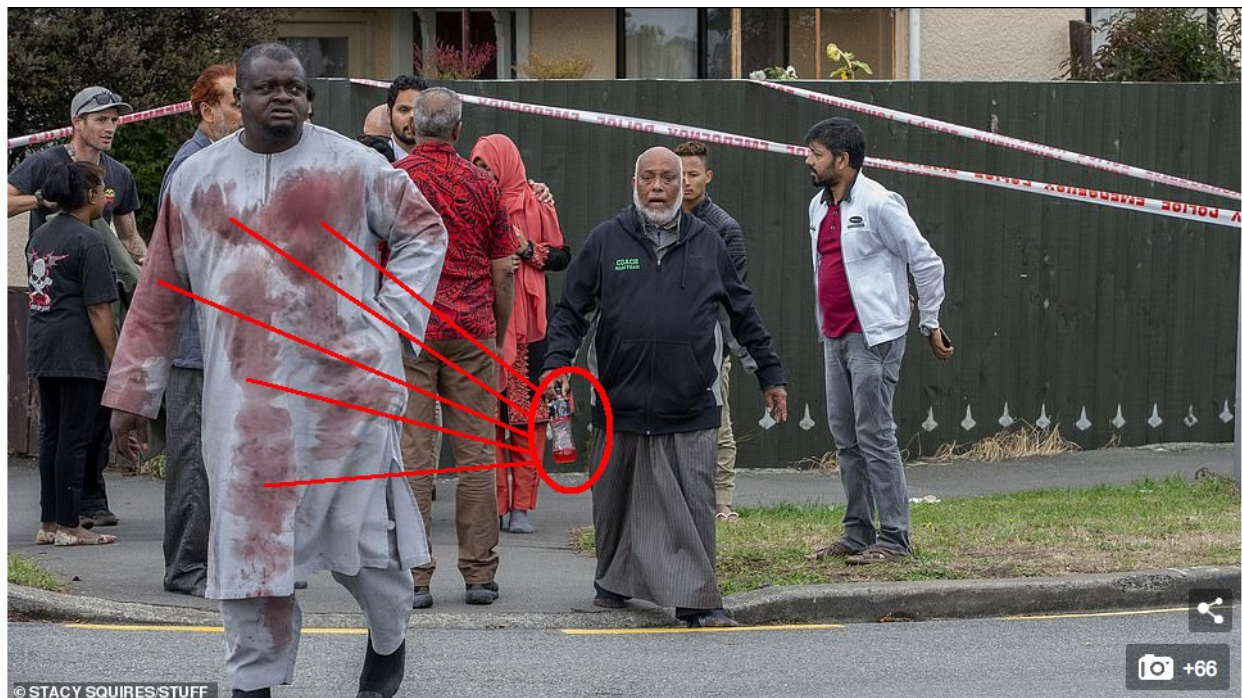
Chilling photos show blood soaked survivors emerging from the Linwood Mosque just minutes after Brenton Harrison Tarrant allegedly opened fire

This single inconsistency is enough to be fatal to the version of the event pushed by the media. However it does not stand in isolation.