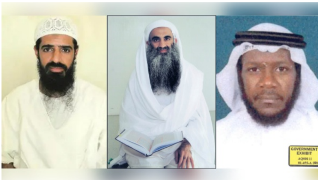
Yemeni Walid Bin Attash (left), Khalid Sheikh Mohammed (center), and Mustafa Ahmed Adam al Hawsawi (right)

I found that photo published in a separate story at Gateway Pundit. Defense Secretary Lloyd Austin has allegedly renounced the plea deal of those three who planned the 911 attacks. But do you notice anything strange? Look closely. I will give you a minute.