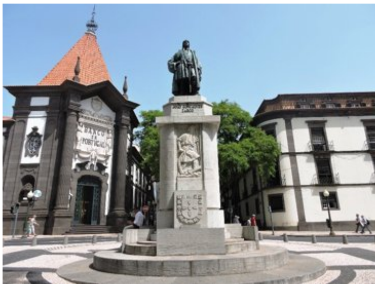
Francisco's statue of João Gonçalves, the Portuguese nobleman who discovered Madeira island in 1419. The monument is located in a central square of Madeira's capital city and is a prominent tourist destination.