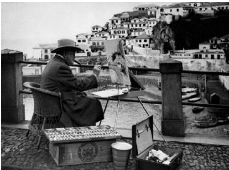
Churchill paints Funchal bay while vacationing on Madeira island, 1950

Indeed, the British were heavily involved in Madeira dating back to the 18th century when they established dozens of trading houses on the island and dominated the lucrative Madeira wine trade. Many British nobles have visited over the years, including Winston Churchill.