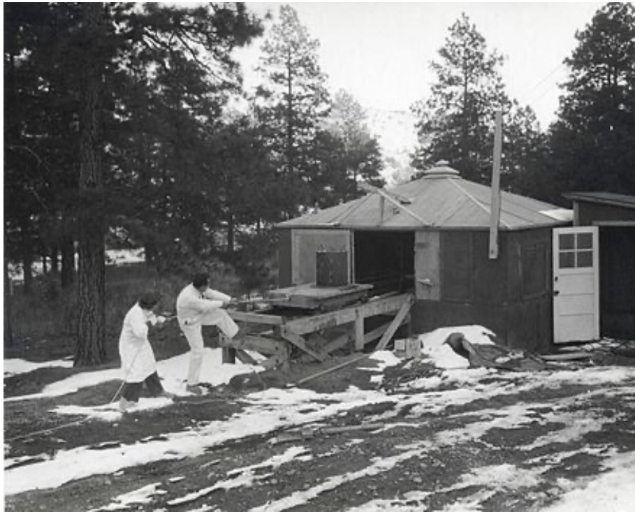
Remote handling of a kilocurie source of radiolanthanum for a RaLa Experiment at Los Alamos