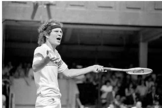
You cannot be serious!!!

Looks like a top-secret billion-dollar AAA-rated military factory to me, boss. You realize they feed you these ridiculous photos on purpose right? It's all part of the joke. They should have called it the TraLaLa experiment.