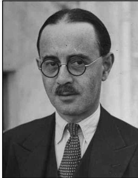
Laski (looking suspiciously like Hitler's geeky cousin)

Nehru was greatly influenced by European traditions of social democracy, so much so that one unnamed wit once remarked that in every Indian cabinet meeting of the 1950s there was a chair reserved for the ghost of Professor Harold Laski, the British political theorist.