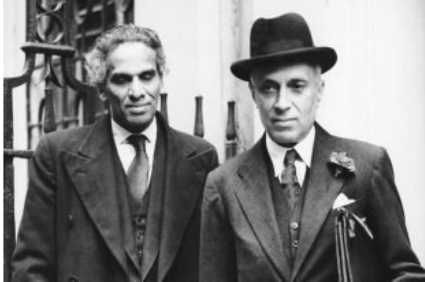
Menon and Nehru – The Goodfellas

Nehru was intimately tied to the Fabian Society (the wolf-in-sheep's-clothing people) and also studied law at the Inner Temple , just like Gandhi. Or did he? This wonderful genuine bona-fide photo should tell you what to think of that: