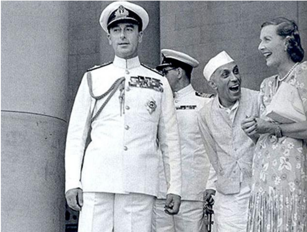
Lord and Lady Mountbatten – with Nehru

I got into this paper by looking into Kash (Cash?) Patel, the newest joker with an Indian background to be foisted upon the public. That soon led me to a larger thesis: the tendency of the Indian to become the Brown Sahib. The Brown Sahib was infamous during the British rule in India since he was, among other things, the intermediary between the British boss and the Indian servant staff, who enjoyed the semi-privileges of being the boss while the master is away or is not looking. Often these Indian sahibs were the very worst of the community, as they had sold out their own morals (take a look at Nehru's face above) in order to enable the oppression of their neighbors.