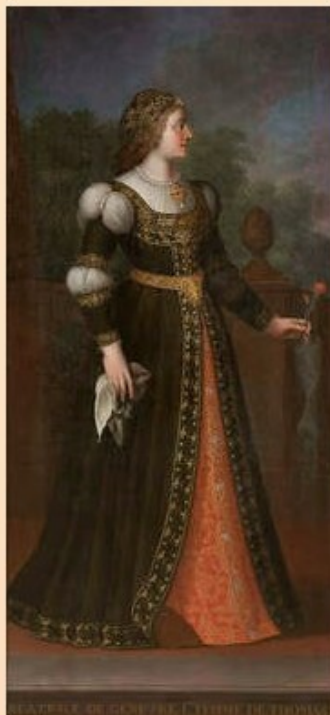
MARGARET OF GENEVA, COUNTESS OF SAVOY, 1180 - 1252, WAS THE DAUGHTER OF WILLIAM I, COUNT OF GENEVA, AND BEATRICE DE FAUCIGNY.