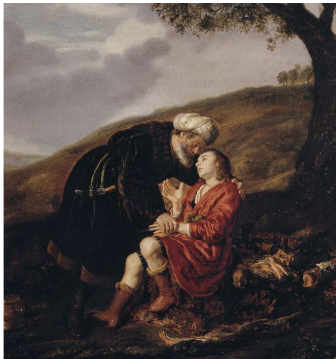
Abraham and Isaac before the Sacrifice, Tel Aviv Museum of Art, 1642.