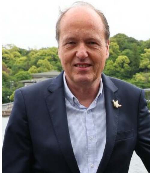
Von der Leyen at the 49th G7 summit